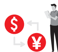
Arbitrage Lower Volatility

Hybrid funds is ideal for budding investors who are eager to take exposure in equity markets.