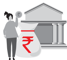
Fixed Income Regular Income