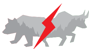
Equity (Unhedged) Wealth Creation